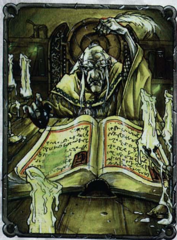
Uhas of Neheli

Greyhawk as "those who protect a great secret, the nature of which they no longer know."