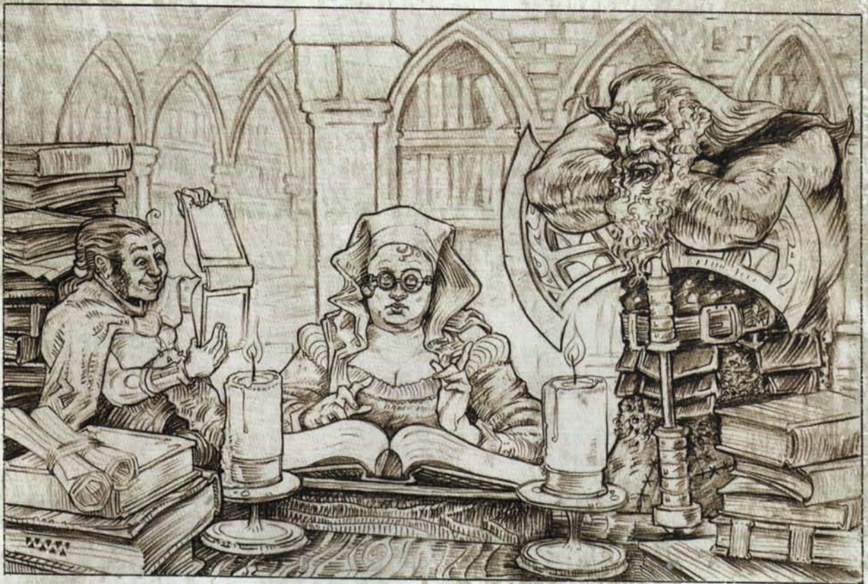
Parties of adventurers often frequent Greyhawk's Great Library.

quarters in a warren of small rooms below the library, but most often can be found manning an impressive desk on a large raised marble platform just inside the building's main entrance. Iquander came to Greyhawk from the Duchy of Urnst a few years ago, on the trail of some elusive bit of arcane lore on behalf of the Society of Sages and Scholars of Nellix Town. He fell in love with Greyhawk's collection, and hasn't left since. Chosen for his position by the previous head librarian prior to that worthy's death, Iquander views the library as the sole living record of the city of Greyhawk (and, to a lesser extent, the Flanaess itself). He sees his role as the protector of that record, a task at which he is occasionally overzealous, redacting certain tomes and doing his best to limit their corruptive impact upon the city's intellectual "canon." Recently eliminated tomes include the entire body of work of the disreputable scholar Estarius Rose, a trilogy of tales of fictional buffoonery featuring a childlike gargoyle puppet, and an odious, notoriously reviled ostensibly humorous history of the construction of Castle Greyhawk known only as Volume 9222 .