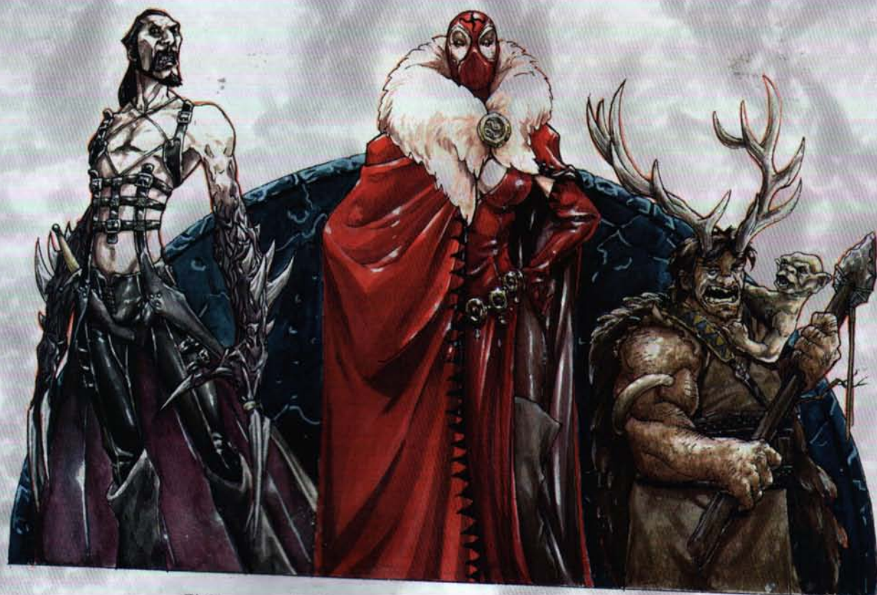
Eli Tomorast, the Vermillion Queen, and Vontok, Lord of Elder Elements