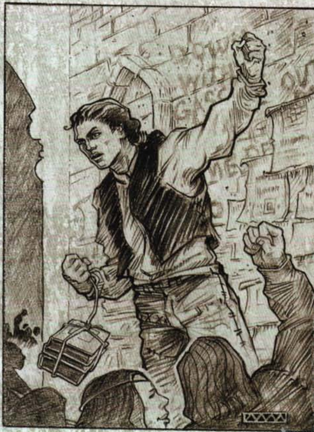
A student agitator in Clerkborg.

ClA) Hall of the Dean. Built within a decade of the college's foundation, the Hall of the Dean is the largest structure owned by the university, containing classrooms, lecture halls, laboratories, and storerooms.